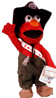
Elmo greets Scouts and staff from the Commissary tent